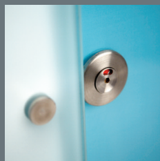
Minimalist indicator bolt

Note: Divisions deeper than 1500mm will incur additional cost