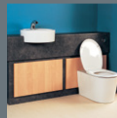
MVS Vanity suite