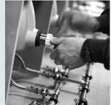
Option of InterPlumb

Note: Any optional enhancements required are clarified at point of specification