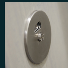
Minimalist stainless steel indicator bolt