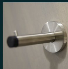
High quality internal fittings

Note: Any optional enhancements required are clarified at point of specification