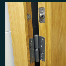
Finely engineered stainless steel hinges and dampener